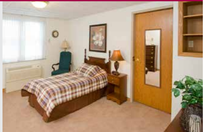
Photo above shows a furnished apartment available for a trial stay

*This program is offered based on apartment availability.