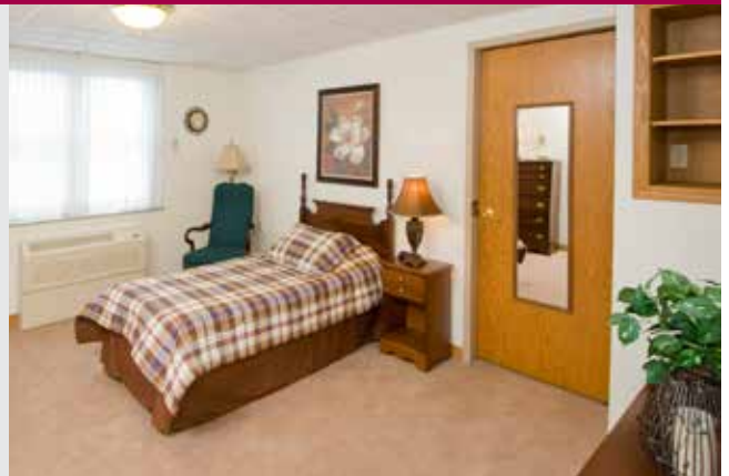
Photo above shows a furnished apartment available for a trial stay

The same inclusions and daily fees apply as required for a long term stay. The basic fee is charged according to the daily rate for the apartment chosen. See rates listed above. Personal Care may be added as described on page four. Services are billed according to the assessment level.