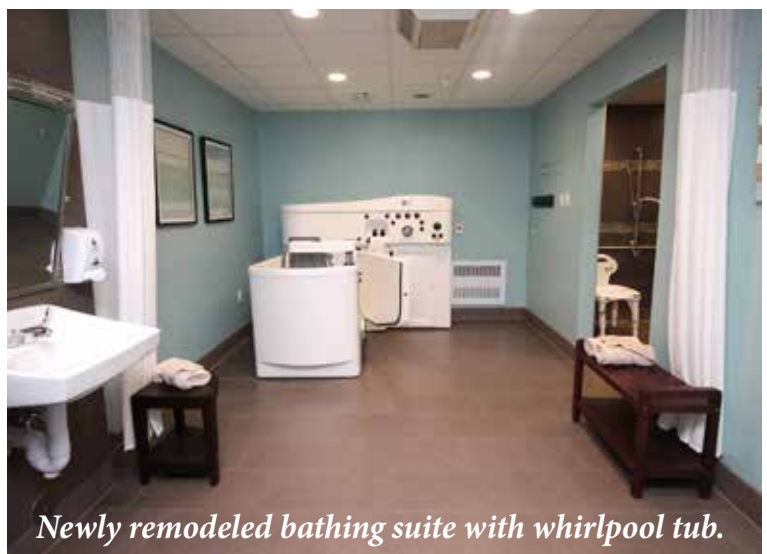
Newly remodeled bathing suite with whirlpool tub.