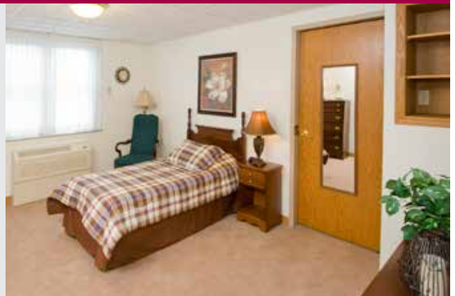
Photo above shows a furnished apartment available for a trial stay

In addition to long term arrangements, a variety of temporary or trial stay options are available. Consider a stay for any reason, any length of time, any time of year. Whether to enjoy a hassle free winter, to provide a break for a caregiver or to receive support when recovering from an illness, furnished apartments are offered with no minimum stay requirements. This is also an opportunity to try out the lifestyle before committing to a permanent move. The same inclusions and daily fees apply as required for a long term stay. The basic fee is charged according to the daily rate for the apartment chosen. See rates listed above. Personal Care may be added as described on page four. Services are billed according to the assesment level.