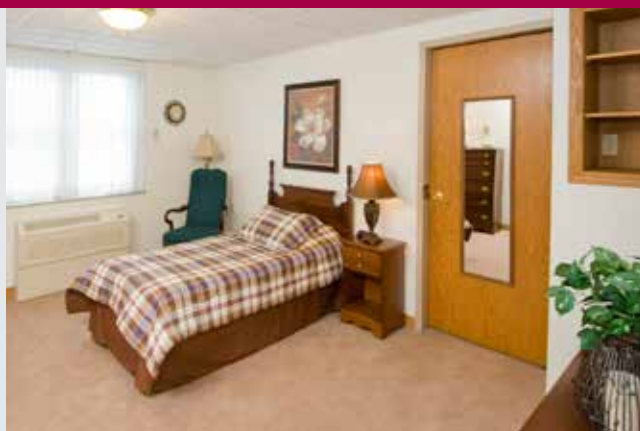
Photo above shows a furnished apartment available for a trial stay

In addition to long term arrangements, a variety of temporary or trial stay options are available. Consider a stay for any reason, any length of time, any time of year. Whether to enjoy a hassle free winter, to provide a break for a caregiver or to receive support when recovering from an illness, furnished apartments are offered with no minimum stay requirements. This is also an opportunity to try out the lifestyle before committing to a permanent move. The same inclusions and daily fees apply as required for a long term stay. The basic fee is charged according to the daily rate for the apartment chosen. See rates listed above. Personal Care may be added as described on page four. Services are billed according to the assesment level.